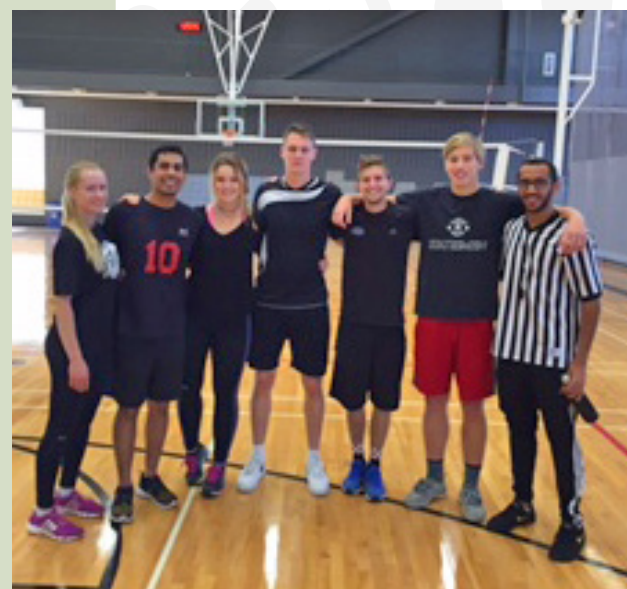
Participants in the IBHS Volleyball Tournament

The IBHS has a long, proud history at UMSL and it looks forward to continuing to prepare international business majors for the future.