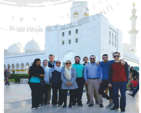
UMSL students in front of a mosque erected by the Emir of Abu Dhabi