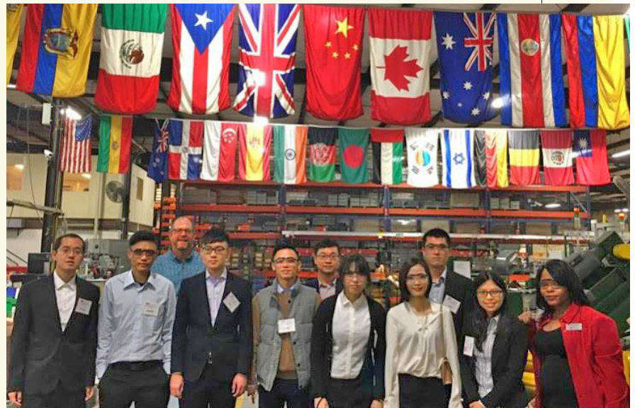
IMBA students in the shipping area in H-J International

H-J is the leading manufacturer of distribution transformer bushings and connectors in the United States and is one of the leading manufacturers and suppliers of transformer and switchgear components for the world market.