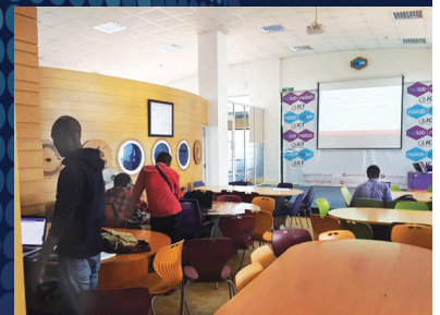
Right: The iHub in Kenya