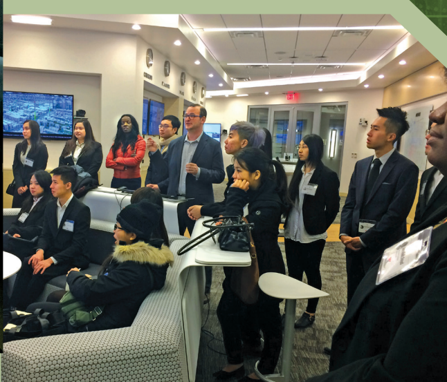
UMSL IMBA students enjoying the tour of World Wide Technology