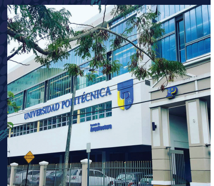
Below: Polytechnic in Puerto Rico