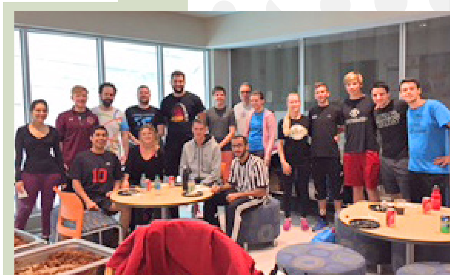
The 2017 IBHS Happy Hour