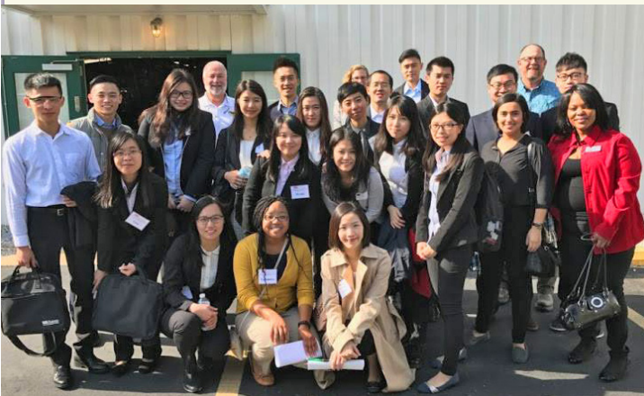
IMBA students and H-J staff at H-J Enterprises main entrance